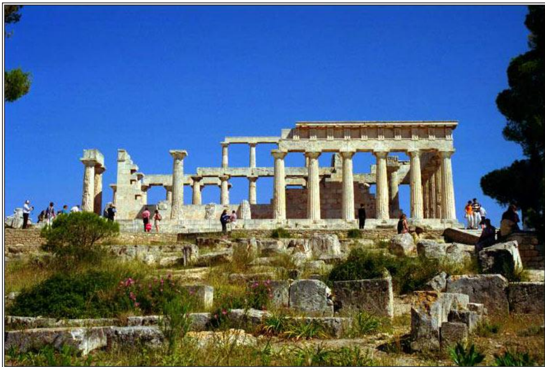
The Temple of Aphaia on Aegina island

The Temple of Aphaia is the best preserved temple in Greece and is one of the 3 temples forming the famous "Sacred Triangle" of Greek antiquity, the other two being the Parthenon in Athens and the Temple of Poseidon at Sounio. Built on top of a wooded hill, it offers magnificent views over the island, the Saronic Gulf, Piraeus and Salamina Island.