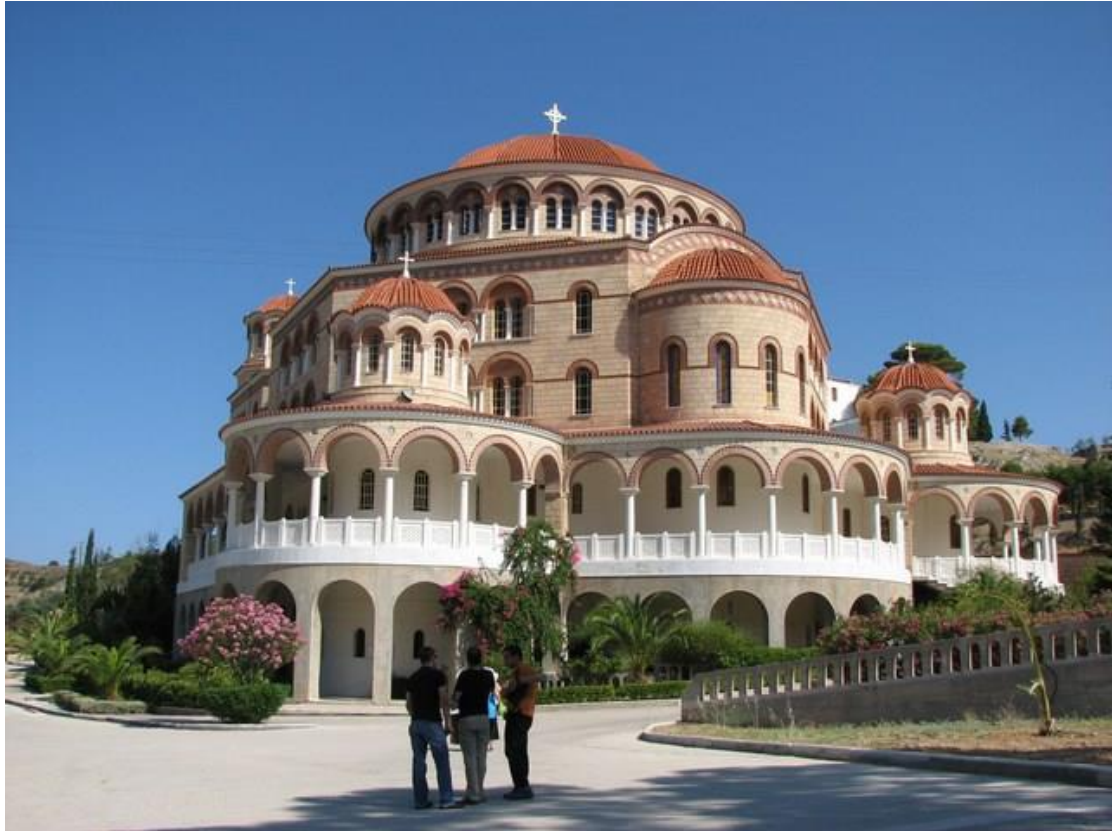
St Nektarios church and monastery on Aegina island

Rather than taking the organised tour you could get your own taxi from immediately outside the port. Recent guests told us that they negotiated a cost of 30 Euros for a taxi to take them to the temple, to wait whilst they explored, and to get them back to the town.