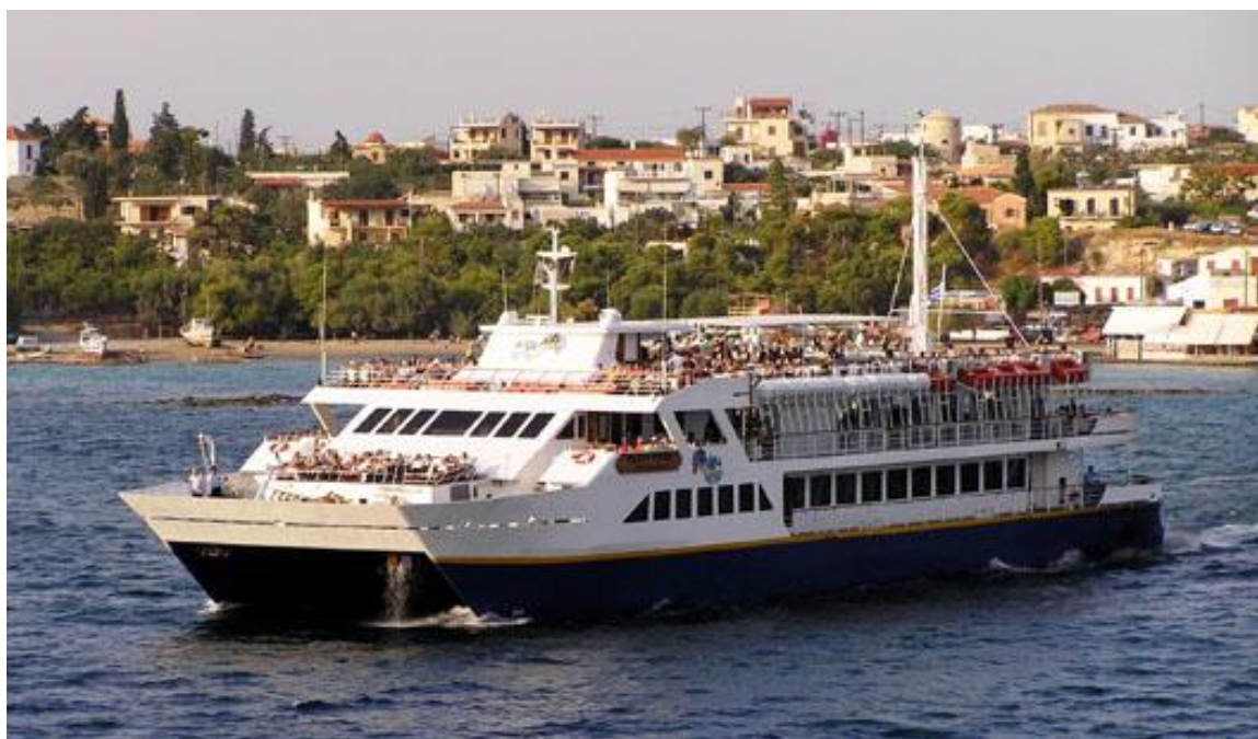
One of the Three Island cruise ships

There will be time ashore on all three islands, perhaps an hour and a half on Hydra, an hour on Poros and two hours on Aegina. The order in which the islands are visited sometimes varies.