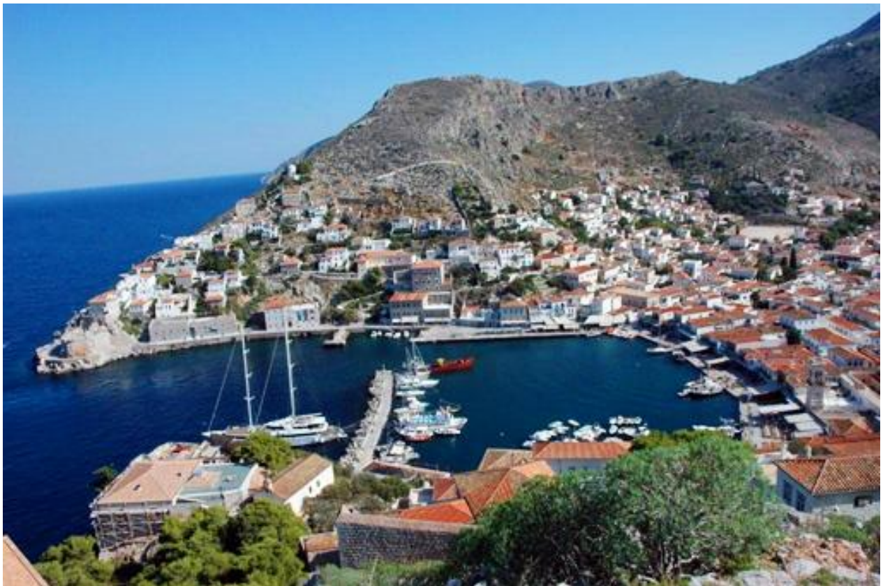
Island of Hydra